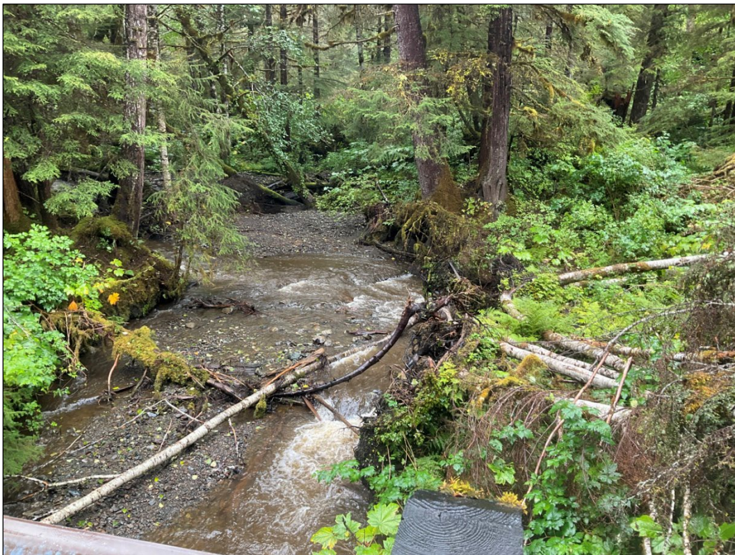
Figure 2.—Upstream view of channel from bridge at waypoint 1636.