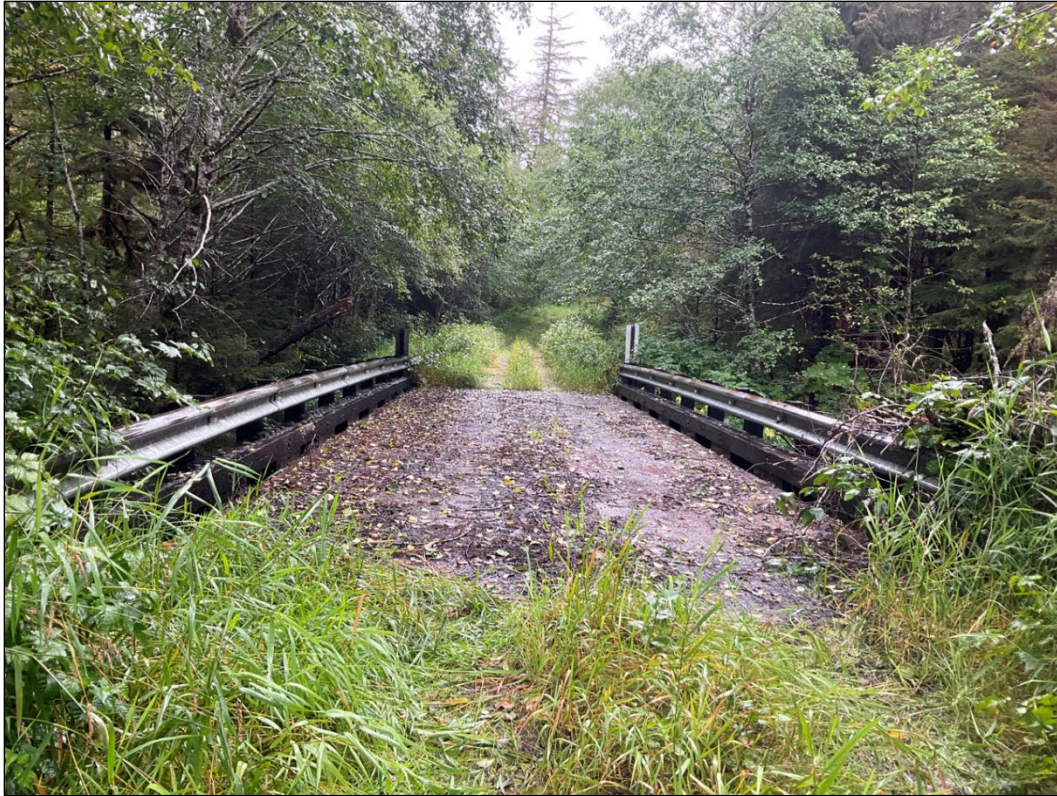
Figure 1.—Bridge surface at waypoint 1636.